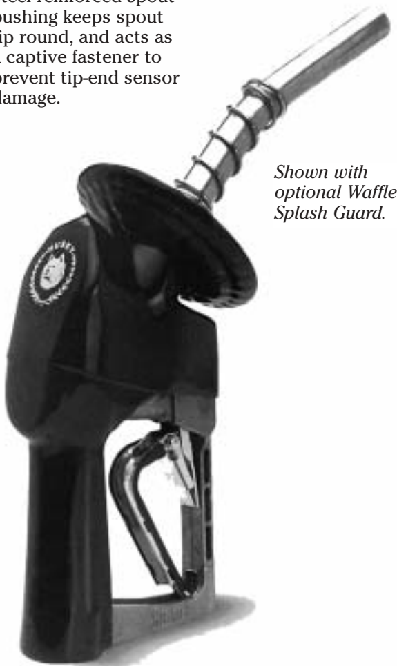
Shown with optional Waffle Splash Guard.