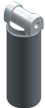
260BHG w/50003 Adaptor