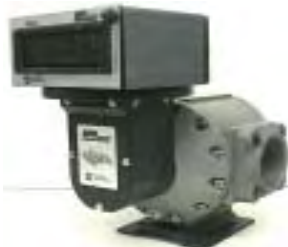
TS20A E _ _

With mechanical register, might include ticket printer, and/or 2-stg preset with valve & linkage.