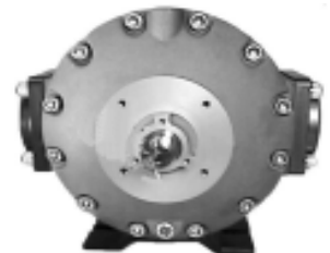
TS20A S _ _

Gland-less flow meter, with ELNC electronic register on bracket mounted on meter case