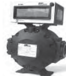
TS20A F _ _

Gland-less flow meter, with an electronic register mounted on right-angle adaptor.