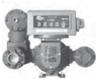
TS20A V _ _

With mechanical register, might include ticket printer, and/or 2-stg preset with valve & linkage.